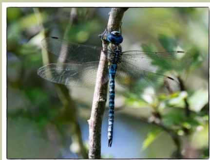
Southern Migrant Hawker